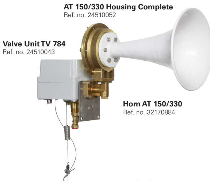
AT 150/330 Housing Complete

A high-power whistle according to IMO for vessels up to 200 m in length