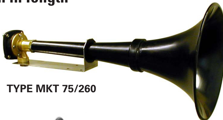
TYPE MKT 75/260