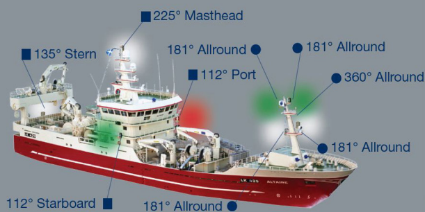
Rule 23 and 26